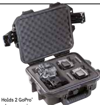
Holds 2 GoPro® cameras and accessories

INTERNAL DIMS: 24.1 x 19 x 10.8 cm (9.5" x 7.5" x 4.25") EXTERNAL DIMS: 30 x 24.9 x 11.9 cm (11.8" x 9.8" x 4.7") LID/BOTTOM DEPTH: 3.8 cm / 7 cm (1.5" / 2.75") WEIGHT: 1.36 kg (3 lbs) WITH FOAM 1.22 kg (2.7 lbs) NO FOAM