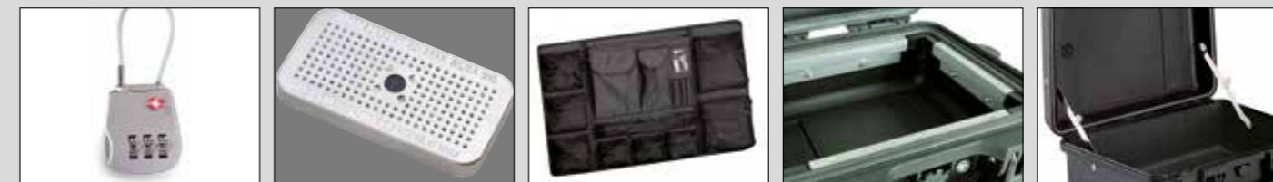
TSA Lock Peli Desiccant (Silica Gel) Utility Organiser Bezel Kit Lid Stays

Refer to www.peli.com for specific accessories available for each case model