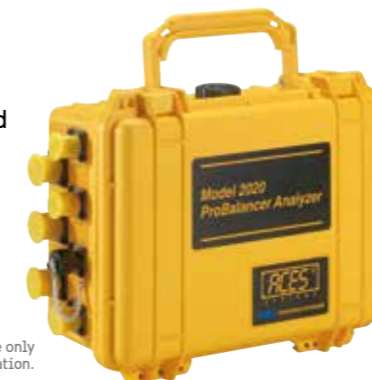
Peli™ Case shown. This picture only serves to illustrate the application.

Peli™ Storm Case allows customisation for electronics. The copolymer material can be machined, drilled and sanded smooth. This makes the Peli™ Storm Case suitable for use with bulkhead connectors.