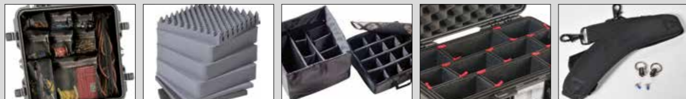
Lid Organisers Replacement Foam Padded Dividers Trekpak™ Dividers Shoulder Straps

Check how to install all accessories through our easy step-by-step Tutorial videos