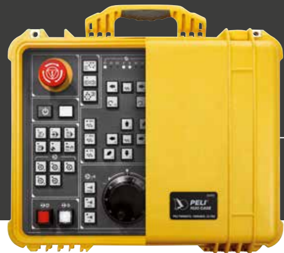
Peli™ Case shown