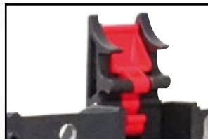
New pull release latch grants additional safety and avoids accidental opening