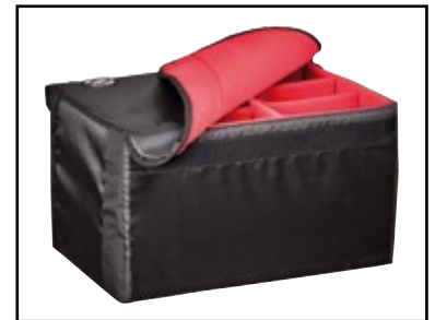
Padded top cover (optional)