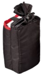
Extractable padded pouches for accessories