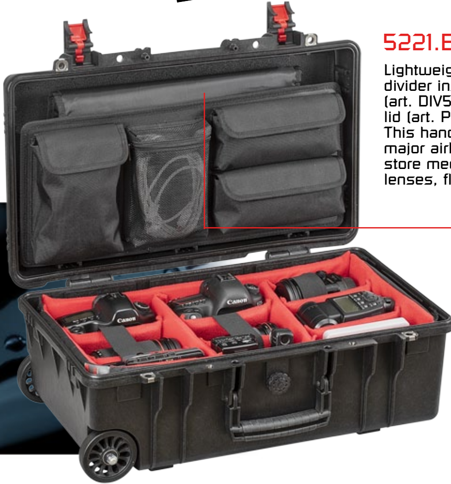
Self-oiling free running wheels

This hand-carry trolley complies with all major airlines' size restrictions. Ideal to store medium format digital cameras, lenses, flashes and other accessories.