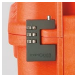
COMBINATION PADLOCK (Art. EXPL COMBILOCK)