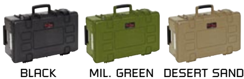
BLACK MIL. GREEN DESERT SAND