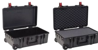
EMPTY WITH FOAM