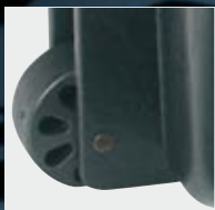
Self-oiling free running wheels