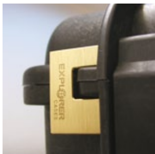
HEAVY DUTY BRASS PADLOCK W/KEY (Art. EXPL PADLOCK)