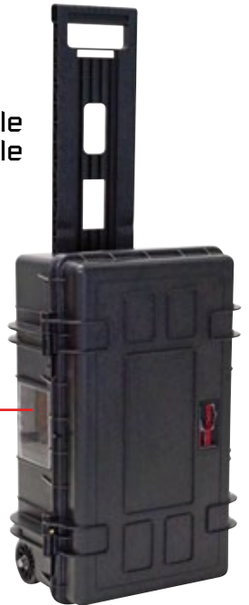
Shipping label holder (optional)