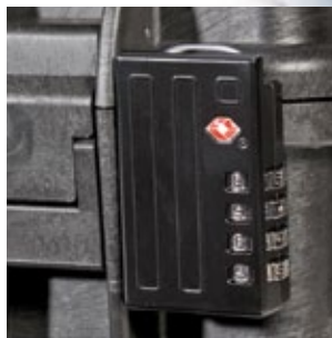
TSA COMBI PADLOCK (Art. EXPL TSA.DIGILOCK)