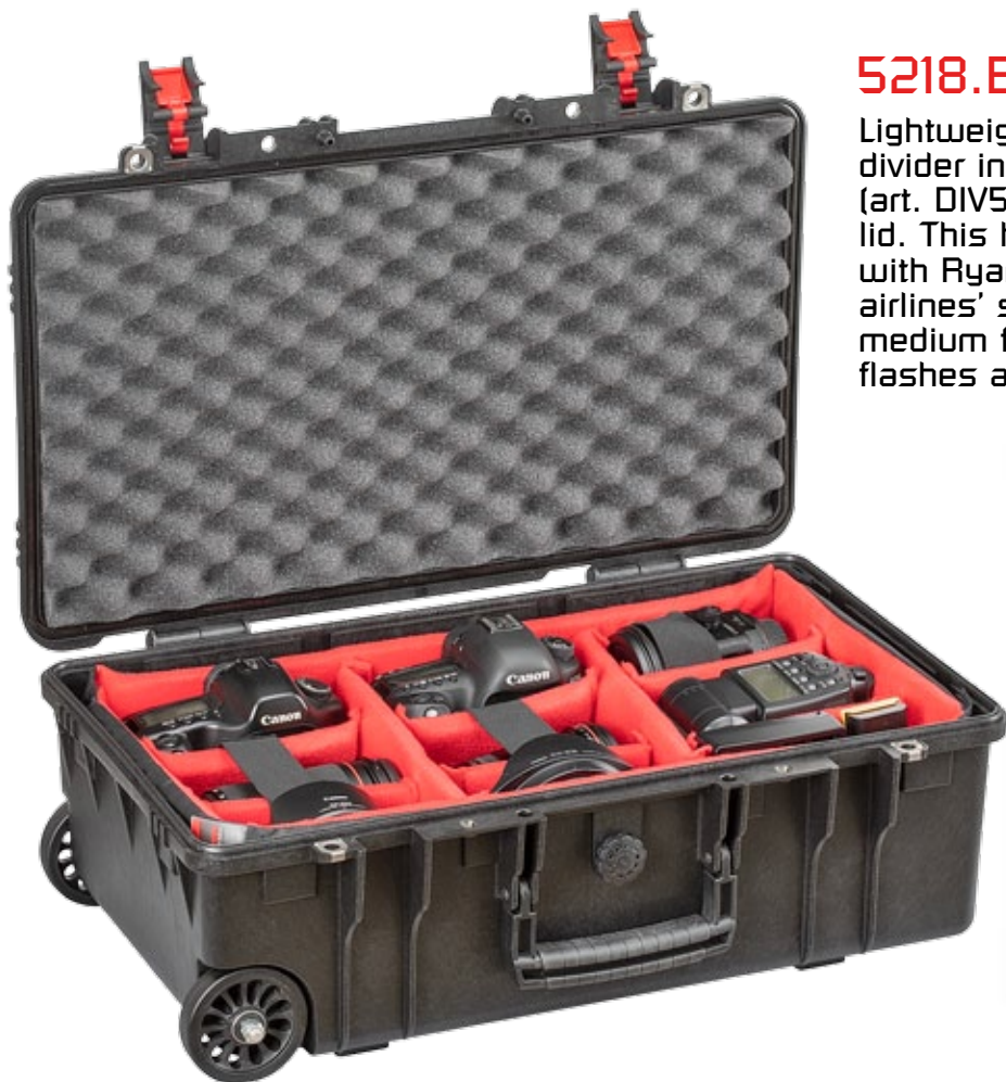
Self-oiling free running wheels