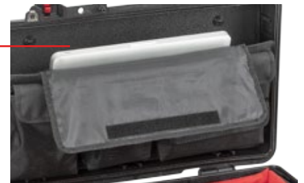
Padded laptop pouch