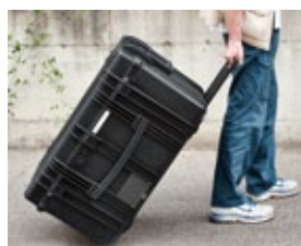
Wheels and extractable handle