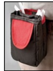
They can be worn with any belt