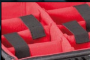
Elastic bands with Velcro are provided to fix small equipment